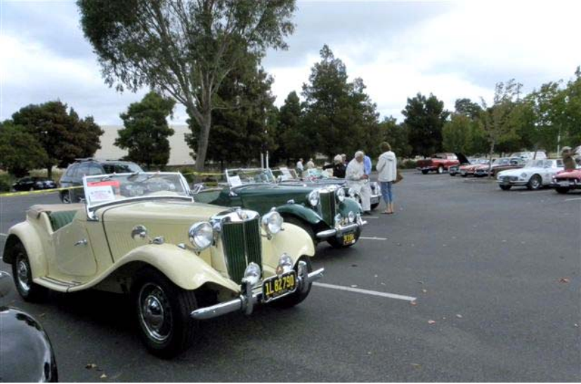
At the car show