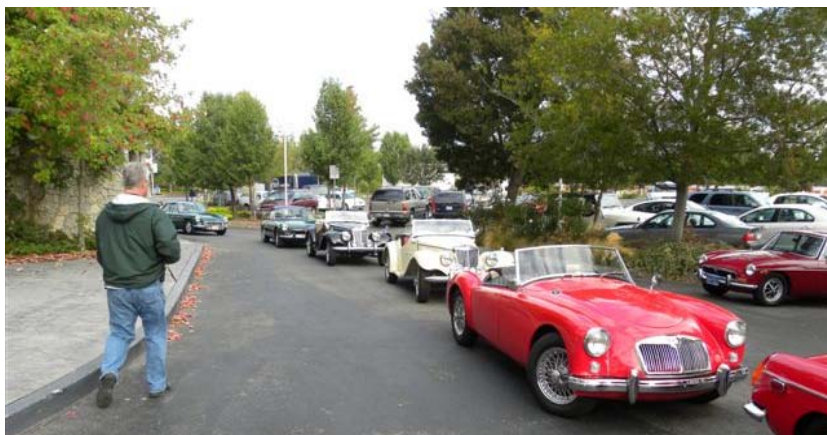
Preparing to depart (above), and on the tour (below)