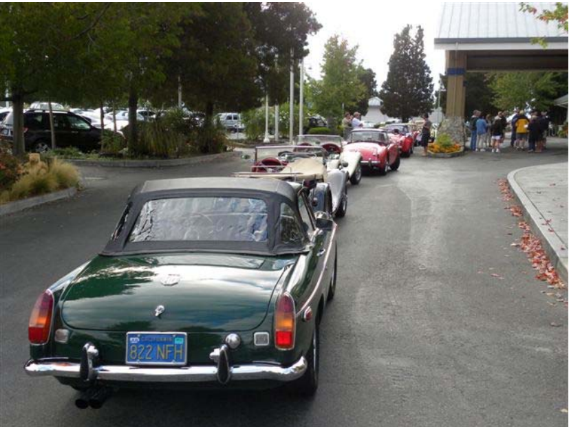
Queuing up for the tour to Infineon Raceway