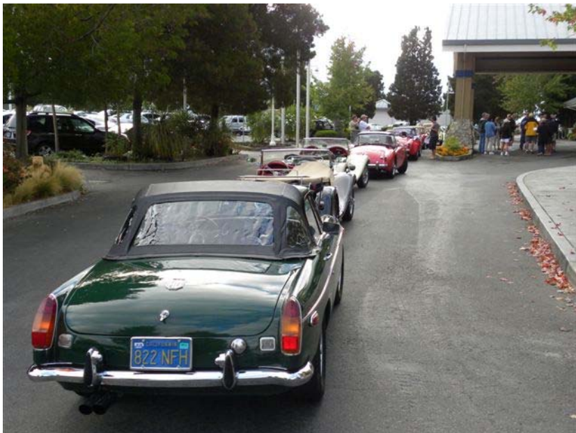
Queuing up for the tour to Infineon Raceway