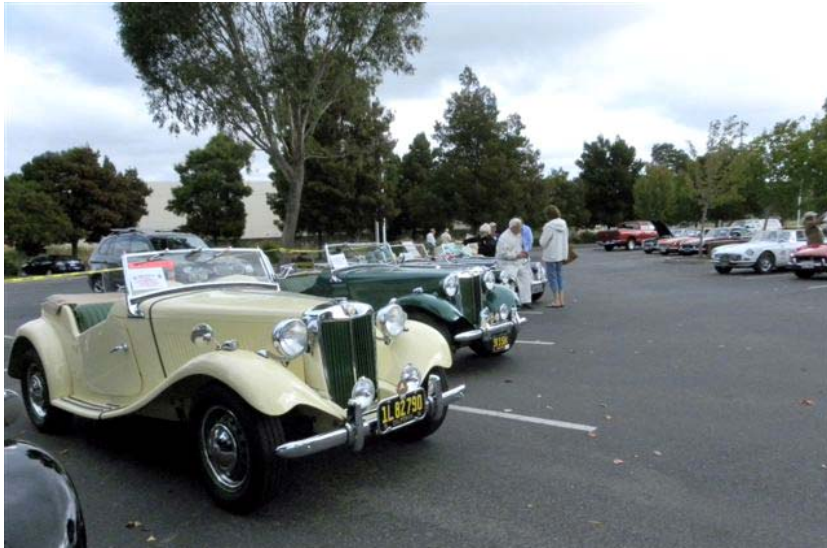
At the car show