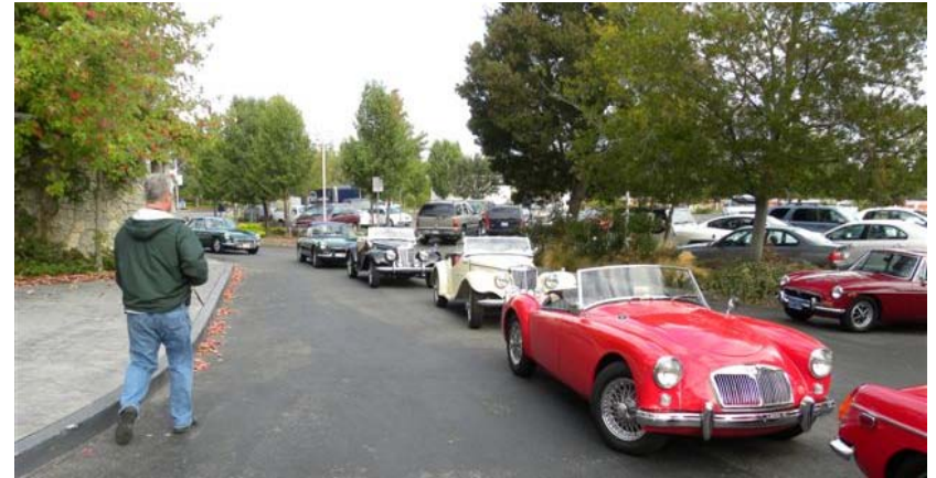
Preparing to depart (above), and on the tour (below)