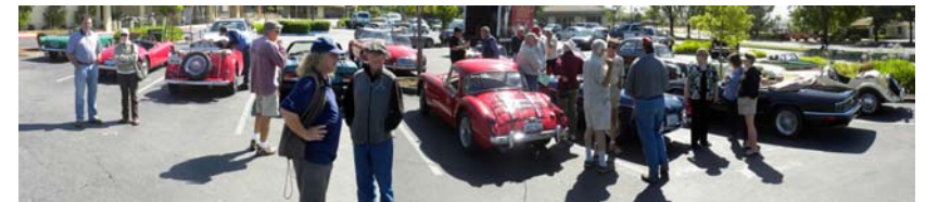
Gathering for the Summer West Marin Tour