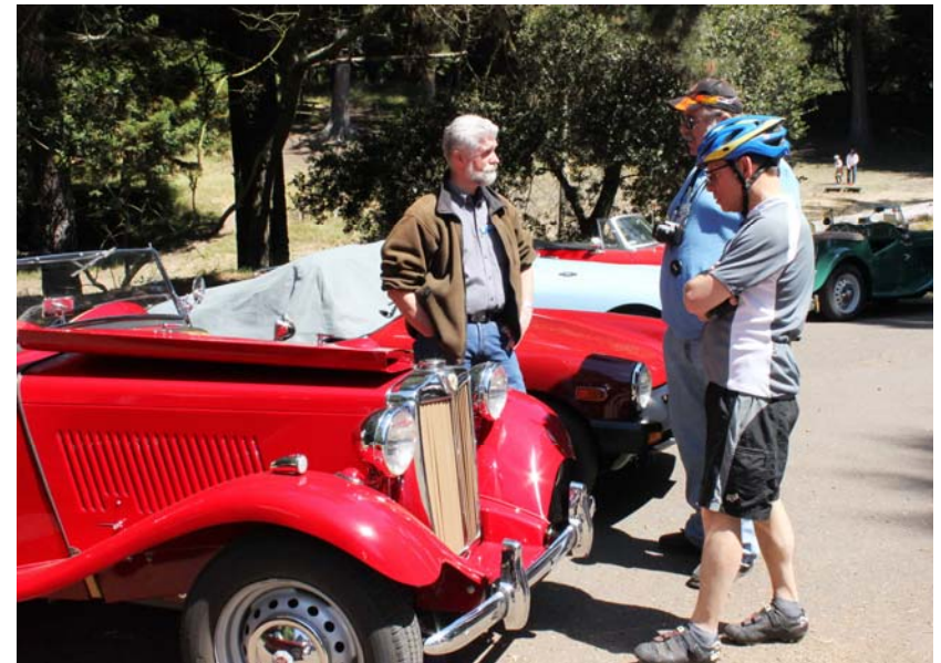
Taking in the cars at the Annual Picnic