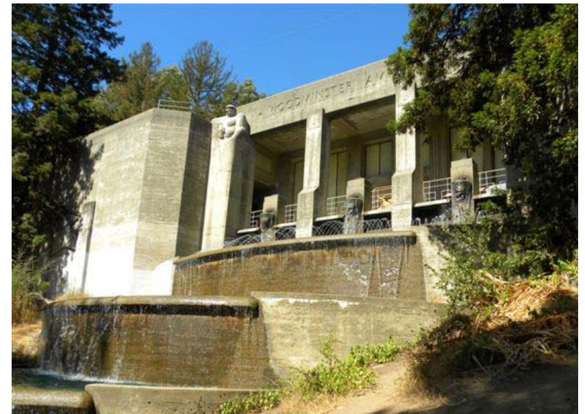
Woodminster Amphitheater Cascades at Joaquin Miller Park

I don't know if any have if any have been imported into the United States yet. According to the MG XPower SV Club there is one (with only 1,000 miles on it) for sale in the UK for 39,995 pounds (about 61,000 in U.S. dollars). I do believe we once had one of the new MG Fs from the early 2000s at MGs by the Bay. Perhaps one day we might see one of these MG XPower SV beasts at our event.