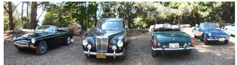
At the Annual Picnic

Oct. 17 – California Autumn Classic , Morgan Hill