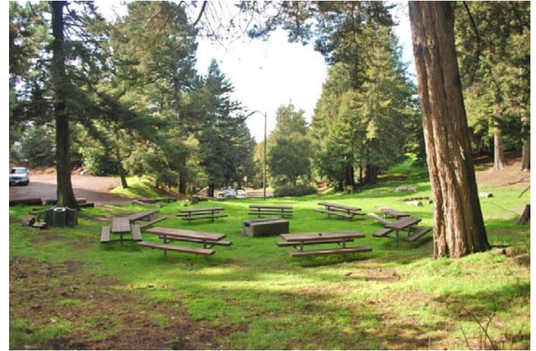
Craib Meadow Picnic Area

You are invited to join fellow MGOC members at our Annual Picnic at Joaquin Miller Park in the Oakland Hills on August 28.